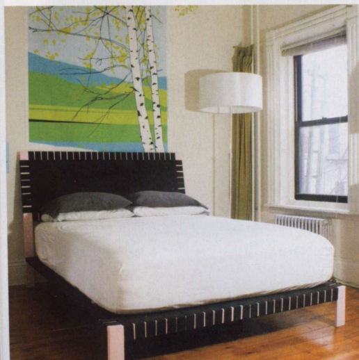
11 SWEET DREAMS Inspired by designer Bruno Mathsson's use of hemp webbing, the 1x3 bed from Uhuru Design + Build, $5,100, has a steel-tube base upon which two-inch cotton webbing is woven to form a platform and headboard. It is available in a blackened-steel or powder-coated finish.