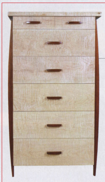
8 DRESS UP Balancing light and dark, this custom-made dresser, $5,200, features curly maple with mahogany legs and drawer pulls. Designed by Robert Shapiro for Balsera Woodworks, the piece incorporates top drawers suitable for jewelry storage as well as a hidden compartment.