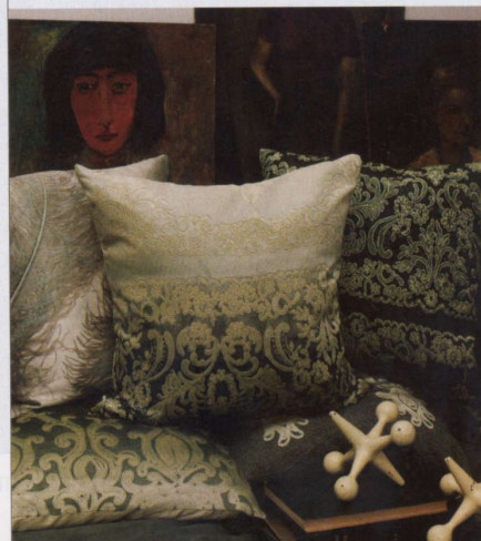
10 CUSHION COUTURE Soft and luxurious, the custom decorative pillows from Aviva Stanoff Design, $275 each, are crafted from velvet that is crushed with real botanicals, feathers and lace. Each 20-inch by 20-inch pillow is hand-dyed as well as hand-painted.