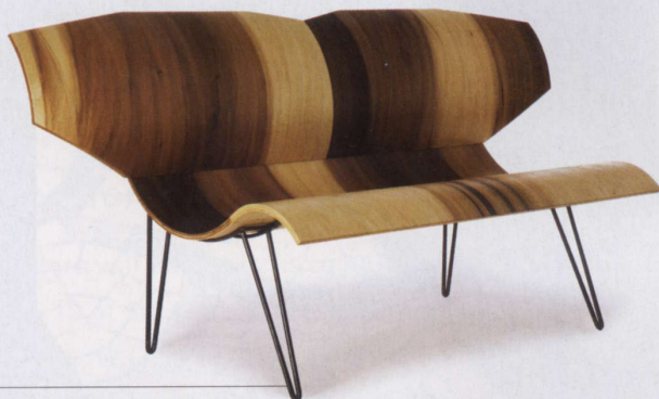
6 CHIC SEAT The Pillow Talk love seat, $8,500, melds sophistication with comfort. Designed and handmade by Susan Woods of Aswoon, the bent poplar plywood piece is the latest addition to the New Wave Line collection.