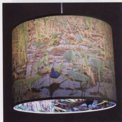
9 NATURAL LIGHT Ed from Andrea Claire Lighting, $320, is a snapshot of nature. An image taken by the artist of Florida's Everglades National Park is laminated to celadon-colored linen, serving as the backdrop of the hanging lampshade.